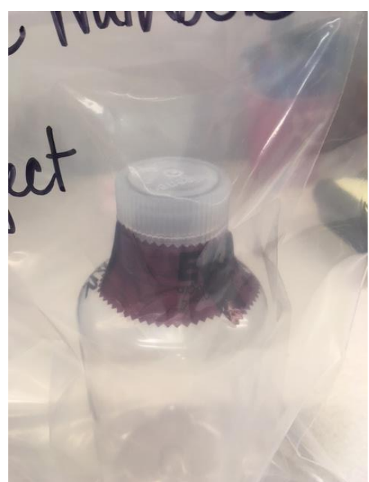
-Greater than 1000mL (1 Liter)